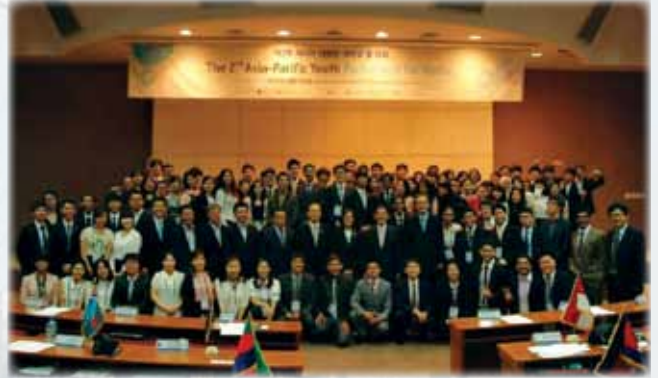
Youth Delegates at the 2nd Asia Pacific Youth Parliament for Water 2013 in Seoul, Korea

18 UNEP SEAYEN Youth Representatives attended the Asia Pacific Youth Parliament for Water held in Seoul, Korea, from 3 to 6 July 2013. The event provided youth leaders with a voice, encouraged them to offer solutions to water challenges, and simulated congressional action. Youth leaders also gained awareness of global and regional problems and learned how to grapple with them.