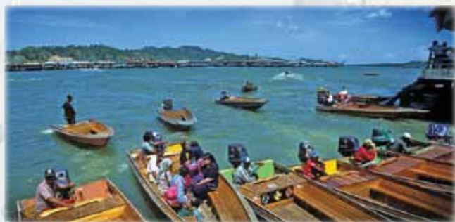
The riverine in the water villages in Brunei Darussalam.

The skimmer concept was introduced by the Youth Representatives of Brunei Darussalam as an innovation to keep the riverine in the water villages of Brunei clean. Kampong Ayer has always been symbolic and regarded as one of the landmarks of Brunei Darussalam. Several villages make up 'Kampong Ayer', which developed as a tourist destination such as Berembang Island and Pulau Muara Besar.