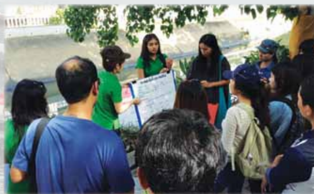
ASEAN Youth Delegates conducting an outdoor water testing project in Chiang Mai, Thailand.