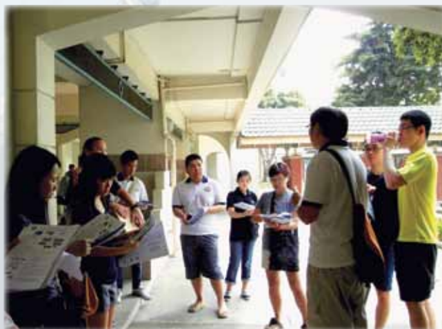
The Eco-Friendly Tampines Central Project initiated by youth volunteers.

Engineering student volunteers from the ITE College East will be trained and will change all the existing lighting to energy saving lighting as part of their effort to mitigate climate change. The team will conduct a review on the pilot project before embarking on a larger scale in 2014.