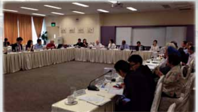
The 13th Governing Council Meeting of the Asia-Pacific Water Forum 2013 in Singapore

The UNEP SEAYEN Youth Representatives from Singapore, Malaysia and the Philippines attended the 13th Governing Council Meeting of the Asia-Pacific Water Forum held at the PUB WaterHub, Learning Oasis Conference Room, in Singapore on 23 July 2013.