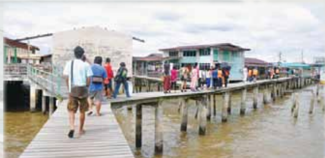
Youth volunteers embarking on water related projects at Kampong Ayer, Brunei Darussalam.

The proposed project has been submitted to the UNEP SEAYEN Secretariat for consideration.