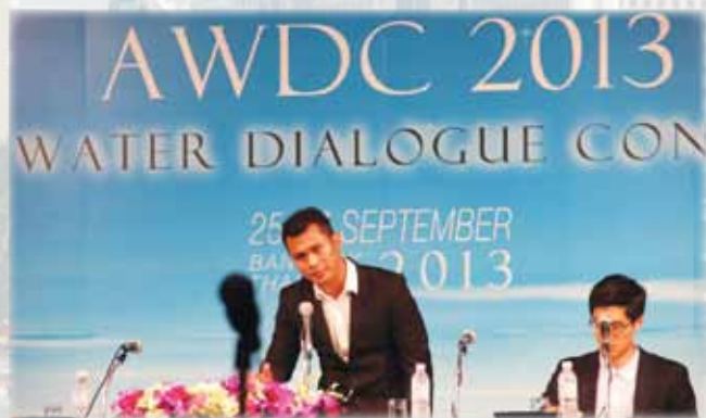
Delegates at the ASEAN Water Dialogue Conference 2013 in Bangkok, Thailand.

In support of the ASEAN Water Dialogue Conference, UNEP SEAYEN, in partnership with the Asian Development Bank, United Nations Economic and Social Commission for Asia and the Pacific (ESCAP) and the Royal Thai Government Department of Water Resources, engaged 40 young water leaders from ASEAN as an integral part of the dialogue on water security in the region. From planning, resource-mobilisation and organising, UNEP SEAYEN youth leaders took prominent roles in the preparation of the ASEAN Water Dialogue Conference held in Bangkok from 25 to 27 September 2013. The AWDC has succeeded in raising awareness of youth's role in water security in the region and enhancing inter-generational partnerships between youth and ASEAN, government, international agencies and civil society organisations.