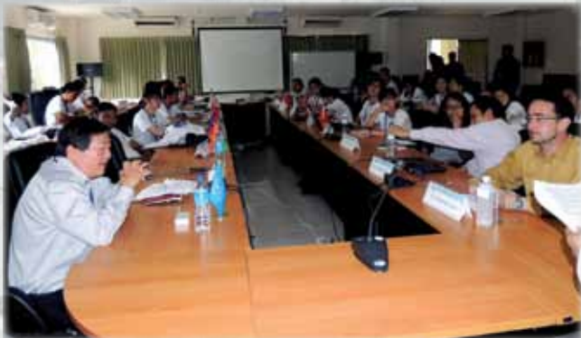
UNEP SEAYEN Youth Representatives at the ASEAN + 3 Meeting at NARIT, Chiang Mai.