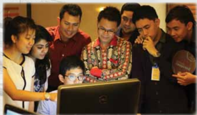
Youth delegates from UNEP SEAYEN brainstorming possible solutions to water issues in the region.

The AWDC 2013 also provided UNEP SEAYEN Youth Representatives with the opportunity and platform to support the implementation of youth commitments, such as the Chiang Mai Youth Declaration and the 2nd Asia Pacific Youth Parliament for Water Declaration.