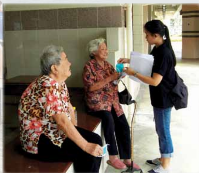
UNEP SEAYEN Youth Leaders distributing masks to the elderly affected by the haze in Singapore.

A proposal has been submitted to the UNEP SEAYEN Secretariat for consideration.