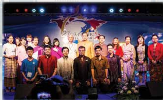
ASEAN Youth Representatives with H.E. Dr Proddprasad Surasawadi, Deputy Prime Minister of Thailand, at the Chiang Mai Convention Centre.

2013 at the National Astronomical Research Institute of Thailand (NARIT), Ministry of Science and Technology of Thailand, Doi Inthanon National Park, Chiang Mai, Thailand, ahead of the Leaders' Summit attended by Heads of State and Government as well as Ministers from the Asia Pacific Region.